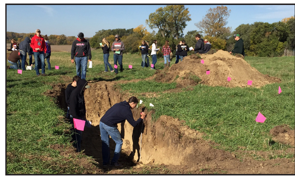
120 students from 38 Nebraska High Schools competed in the State FFA Land Judging contest near Scribner on October 18th. The top individual and winning team came from West Point High School. Congratulations!